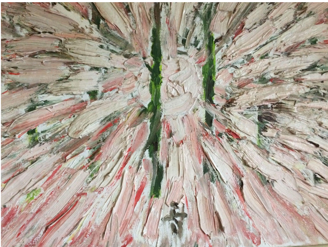
Flash of non dazzling bright white light visible at the Causal state, see figure 1