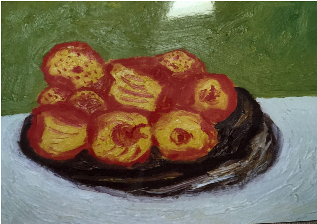
Organic fruit from the market

being friendly and respectful to your fellow human beings meeting at the marketplace, buying e.g. some organic fruit. Or contributing to a better life and future for a child. Or an animal, or taking care of your garden.