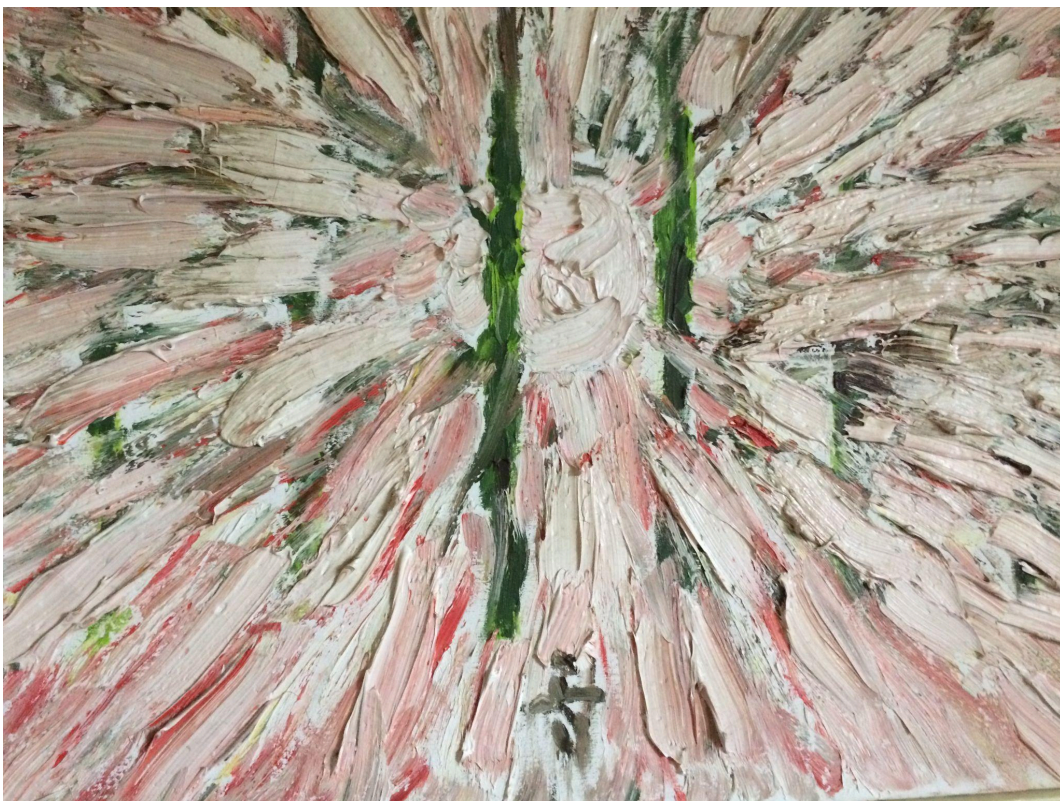
Flash of non dazzling bright white light visible at the Causal state, see figure 1